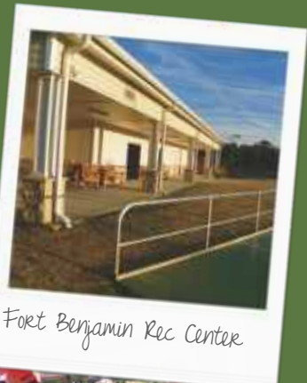
Fort Benjamin Rec Center

The newest park located in the heart of the County offers something for everyone. Children enjoy the large playground area with a variety of equipment for ages 2 to 12 years. The Band Shell, which overlooks the park, provides a unique setting for events such as concerts, art shows or theater productions. Picnic shelters and grills are also available for your next birthday party or family reunion. Fort Benjamin Park inspires a healthy lifestyle by offering fitness classes suitable for all levels or outside sports and recreation opportunities such as tennis, bocce ball, disc golf, basketball, walking trail with fitness stations, and much more. Inside the Recreation Center is a game room with billiard and ping pong tables and a classroom for fitness. Rental of the facility is open to the public for occasions such as business meetings, dinner banquets, presentations or parties. The Main Hall can accommodate groups up to 200 people complete with audio visual equipment and a full catering kitchen.