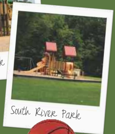
South River Park