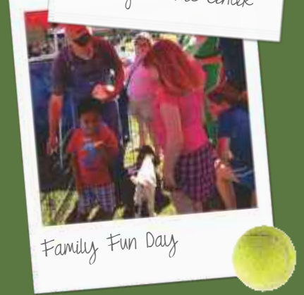
Family Fun Day